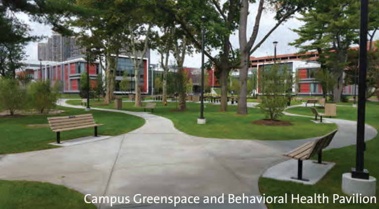
Campus Greenspace and Behavioral Health Pavilion